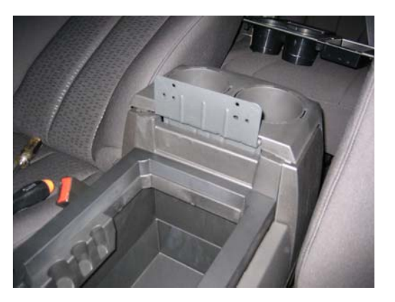
Remove (4) hex screws holding armrest pad from hinge